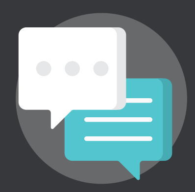
Allow employees to share their small happiness over small online chats