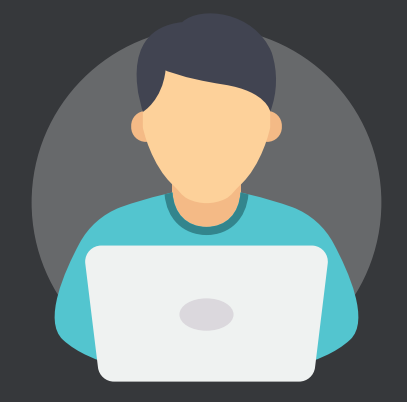
Give room for employees to let off some work steam, build relationships and boost productivity